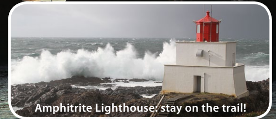
Amphitrite Lighthouse, stay on the trail!

T he Wild Pacific Trail traces 8 kms of the rugged west coast of Vancouver Island. Enjoy matchless panoramic views of Barkley Sound and the Broken Group Islands. This famous trail meanders beneath the forest canopy and along a spectacular coastline abundant with birds and marine wildlife. A memorable walk for hikers of all abilities.